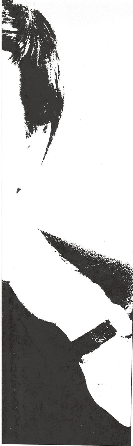
executive of the Lanarkshire Development Agency

on before velopment rk is com- ore than face space