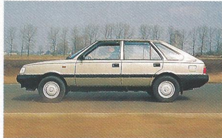
A low-cost family diesel, the new Polish-built FSO Caro 1.9 five-door

These new vehicles should not be confused with the FSO products imported throughout the Eighties, as the new engines and vastly improved build quality have considerably enhanced both performance and appearance.