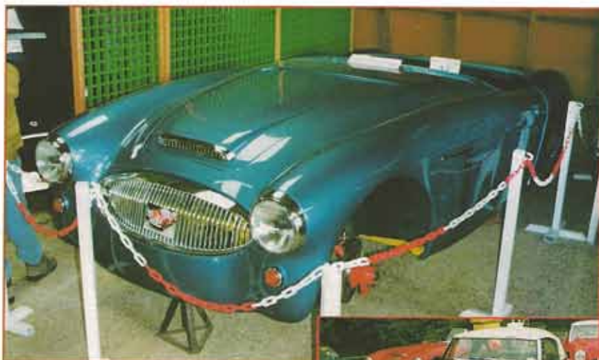
The new 3000 style body uses the same chassis and allows customers to build a full works Healey replica. This one's original.

hydraulic mounts and you feel very little vibration, the controls, especially the throttle, feel very soft and spongy and at times you feel as if you are just not connected to the motor. Start her up and the noise immediately strikes you; there isn't any! Well, there is a bit but not what you and the interested party of onlookers expect from a Healey. Press the throttle and it hardly increases so you have to feel rather than hear the point at which the clutch and throttle interact to produce forward motion. Then you're moving and almost immediately, you need second; first is very low. Pull back the stick on the MT 75, five speed box