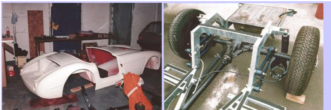
Left: This was to become car number 1: Q315 RDS. The red body acquired from the company in Nottingham was painted white.

One of these two cars was to become Q315RDS.