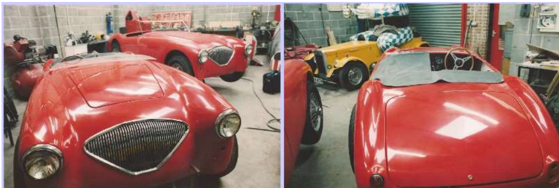
1987: Photographs taken at the Nottingham location where one body was bought together with the moulds.

One of these two cars was to become Q315RDS.