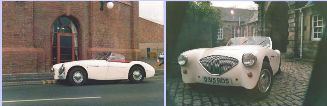
Photo session for the first brochure.

Then 20 years later (2014) the car is offered for sale.